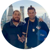
Young Jewish Leaders Share Mitzvahs