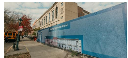
A billboard proudly showcasing our alumni has been hung at our Eastern Parkway Campus

Even the alumni who are not officially part of the prestigious group of Chabad shluchim maintain strong bonds with their classmates and are staunch supporters of their community endeavors. Many alumni groups have started a new trend of organizing class reunions and weekend get-togethers to celebrate various milestones. These events are often held to commemorate anniversaries such as 25 years since graduation or the year in which their fellow classmates turn 50. This is a testament to the strong connections and bonds that are formed during the school years and the camaraderie that they feel towards each other even years following their graduation.